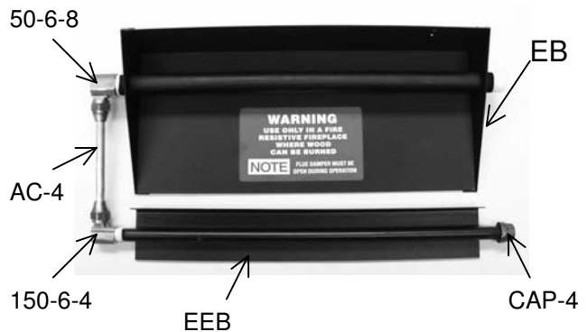
Figure 2 BURNER PAN MEDIA